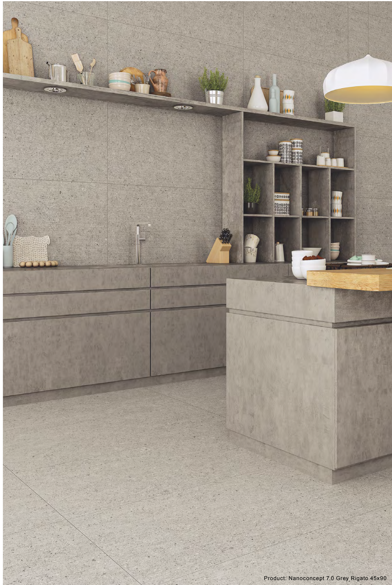
Product: Nanoconcept 7.0 Grey Rigato 45x90