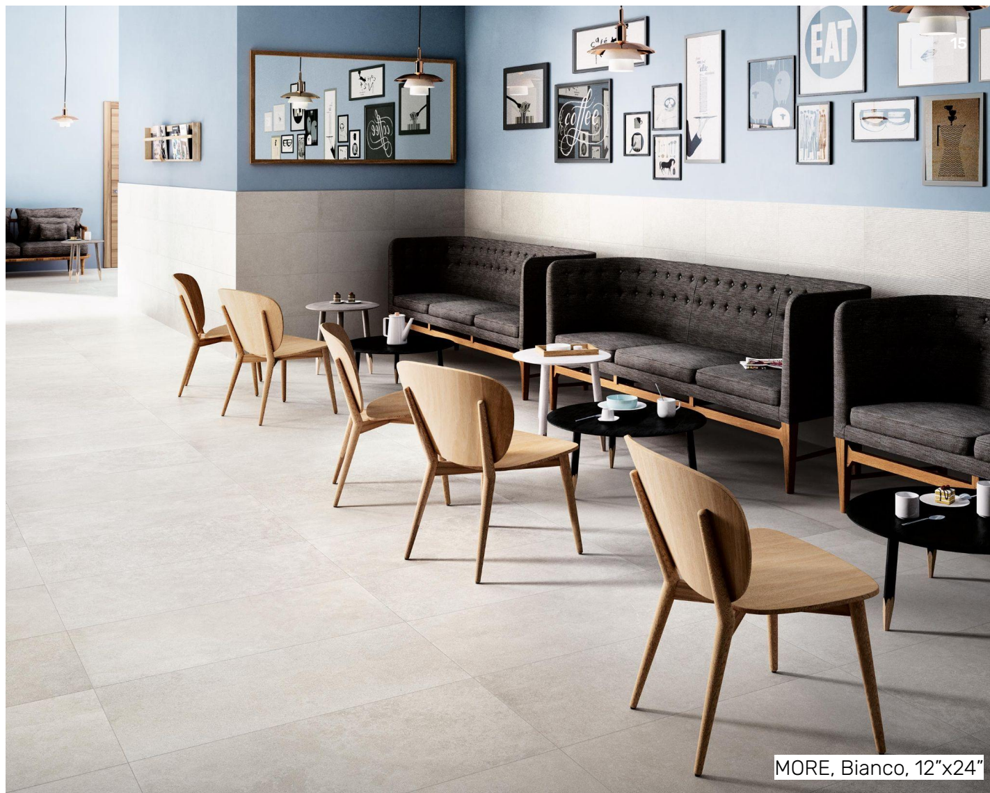
MORE, Bianco, 12"x24"

Links: Line Catalogue Technical Datasheet