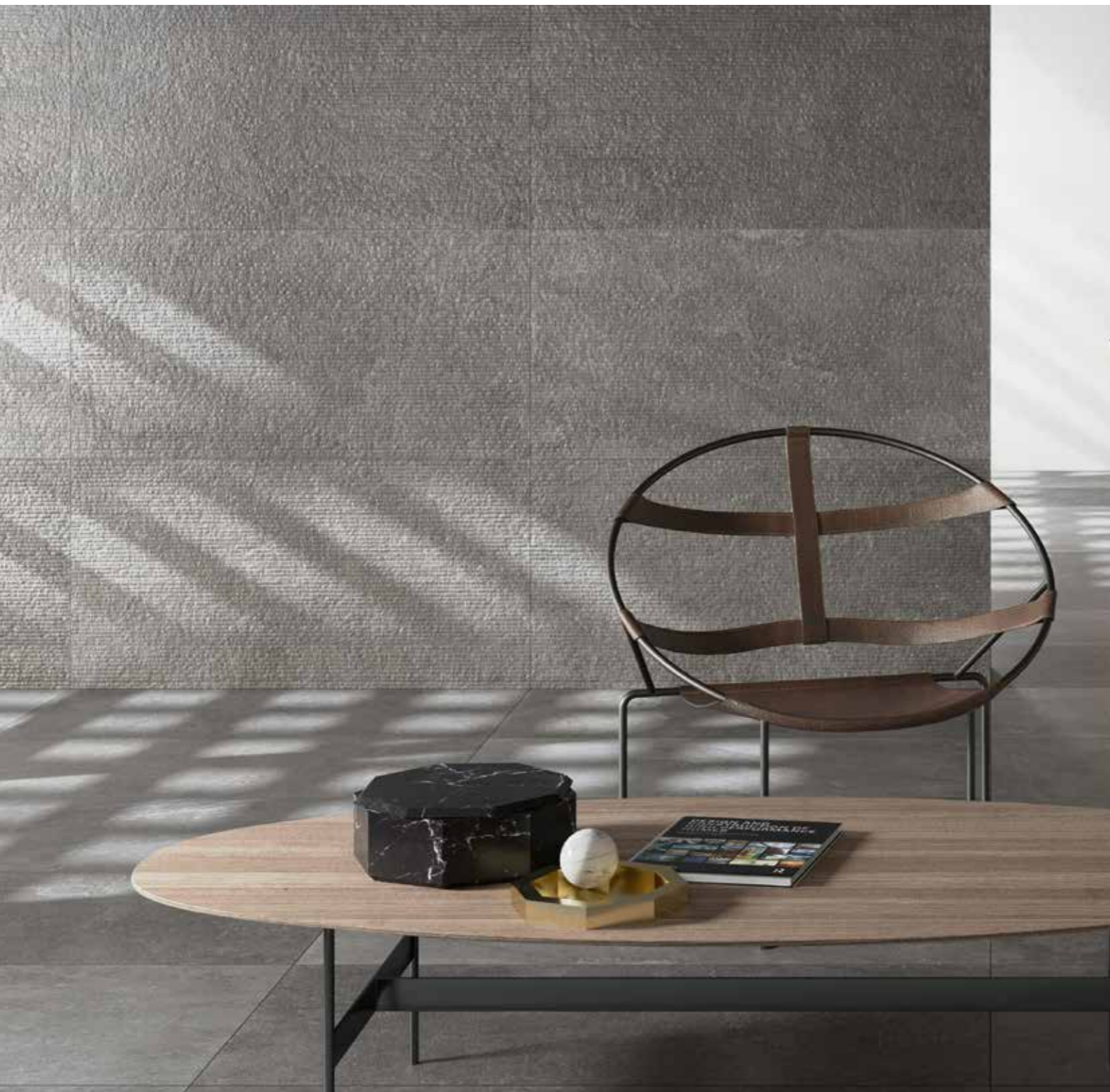
WALL IN: LITH_HEIRLOOM BLUE_CHISELED_24"x48"