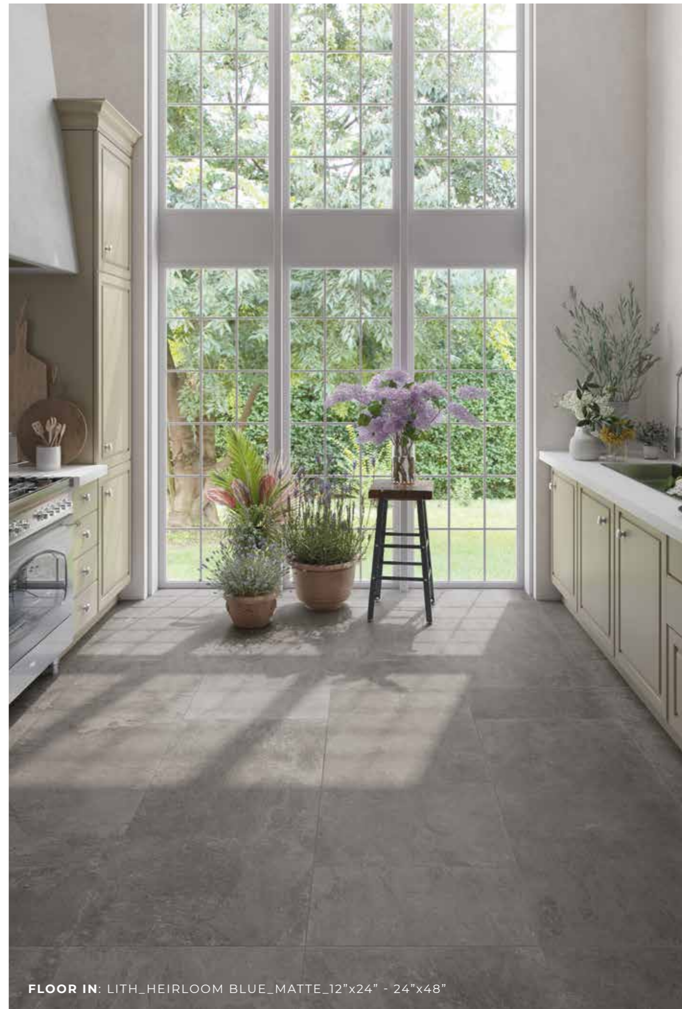
FLOOR IN: LITH_HEIRLOOM BLUE_MATTE_12"x24" - 24"x48"