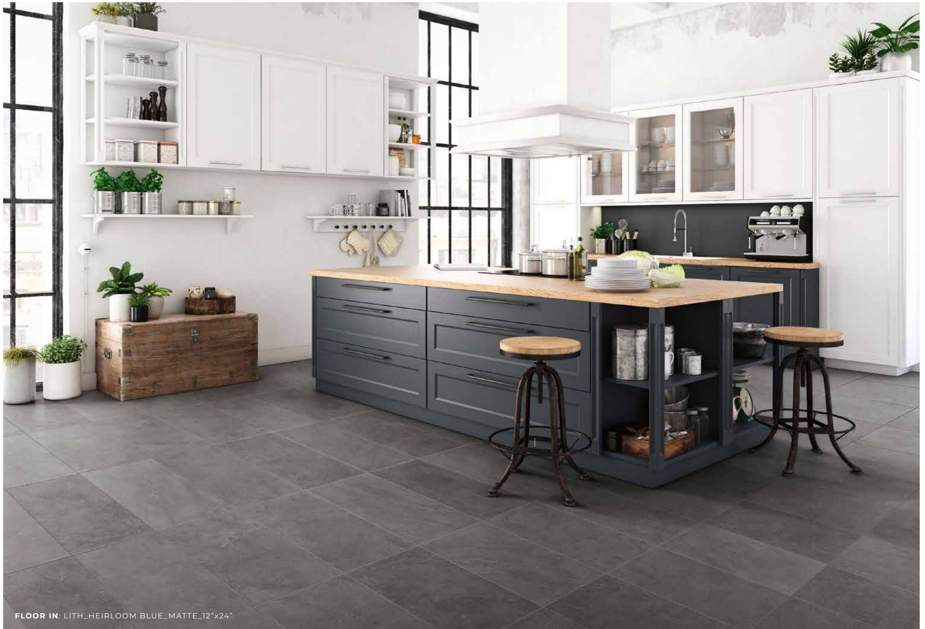
FLOOR IN: LITH_HEIRLOOM BLUE_MATTE_12"x24"