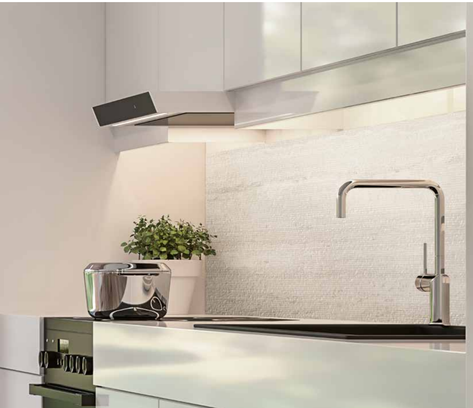
WALL IN: LITH_LEGACY WHITE_CHISELED_24"x48"