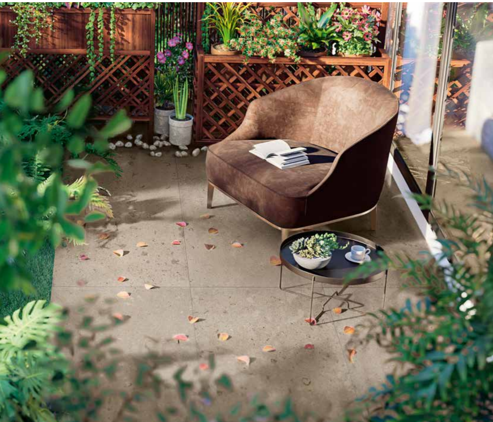
FLOOR OUT: LITH_ANTIQUÉ CREAM_24"x48" _2 CM