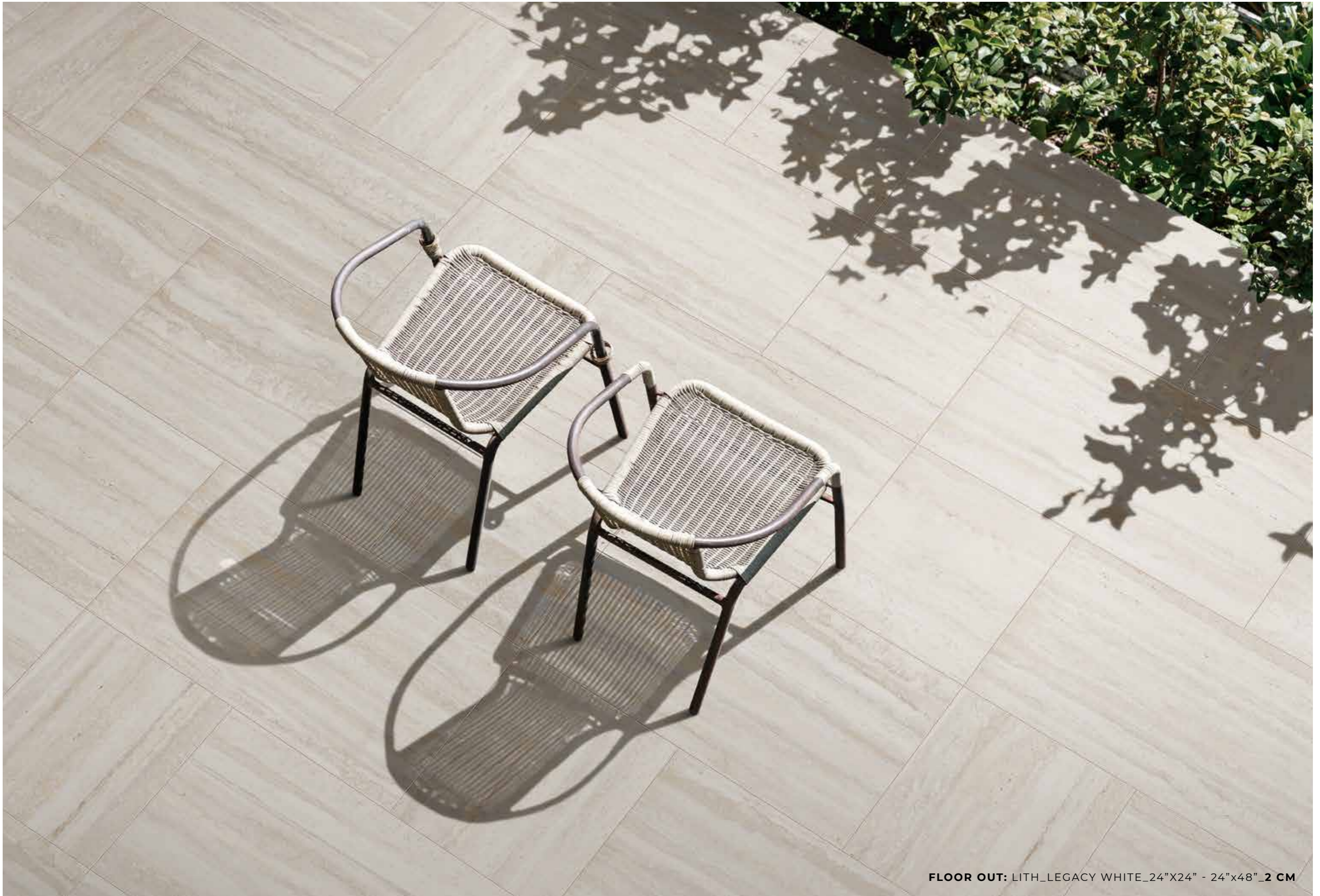
FLOOR OUT: LITH_LEGACY WHITE_24"X24" - 24"x48" _2 CM