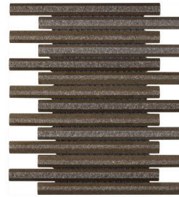
Dimension of Sheet

Gray net may be visible from between joints. Colors may vary even within the same batch. Joint widths may vary even within a sheet.