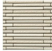
HAL-20BR/HB-1 Light Beige