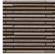
HAL-20BR/HB-7 Light Dark Brown