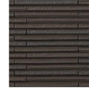
HAL-20BR/HB-12 Deep Brown