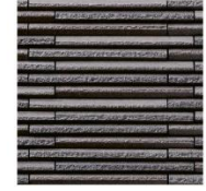
HAL-20BR/HB-6 Dark Brown