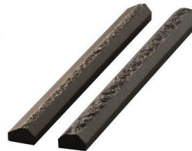
Dimension of piece ( 2 type mix )