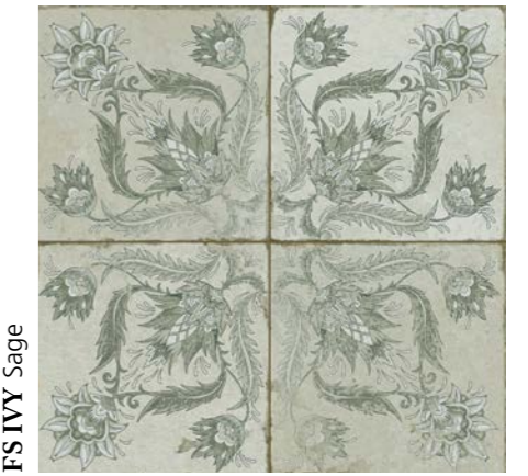
FS IVY Sage