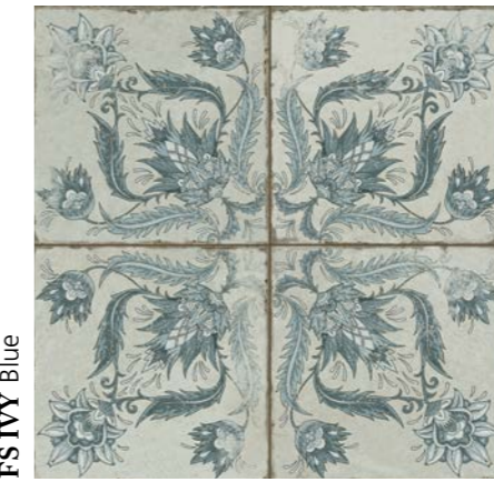
FS IVY Blue