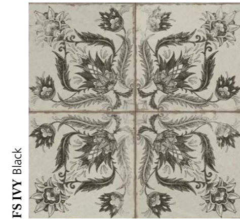
FS IVY Black