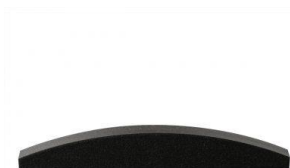
Dimension of Sheet