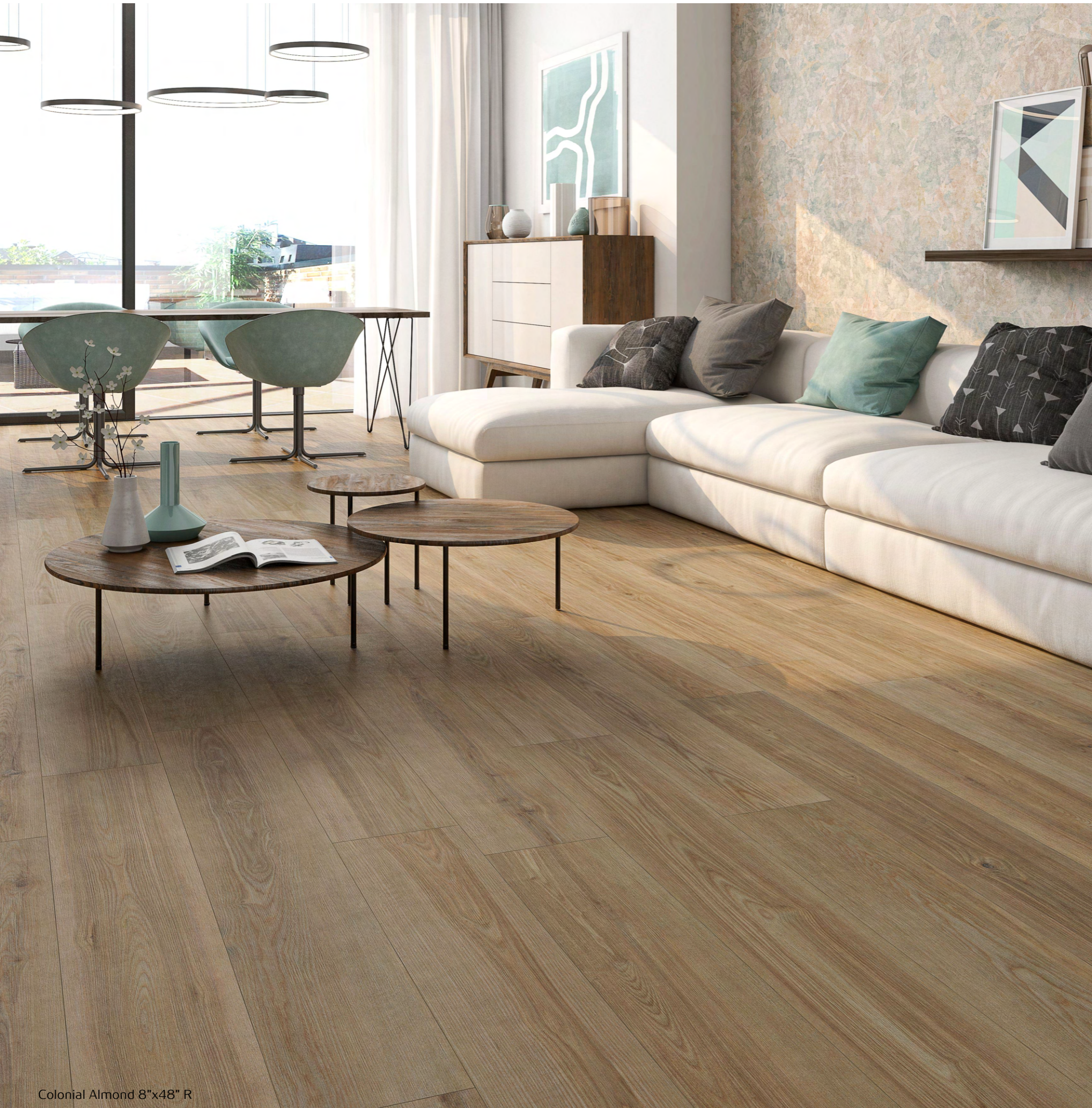
Colonial Almond 8"x48" R

Natural elegance. The warmth and beauty of wood with an exclusive and smooth aesthetic. This collection emulates the unpredictable natural wood in three tones - white, roble and almond.