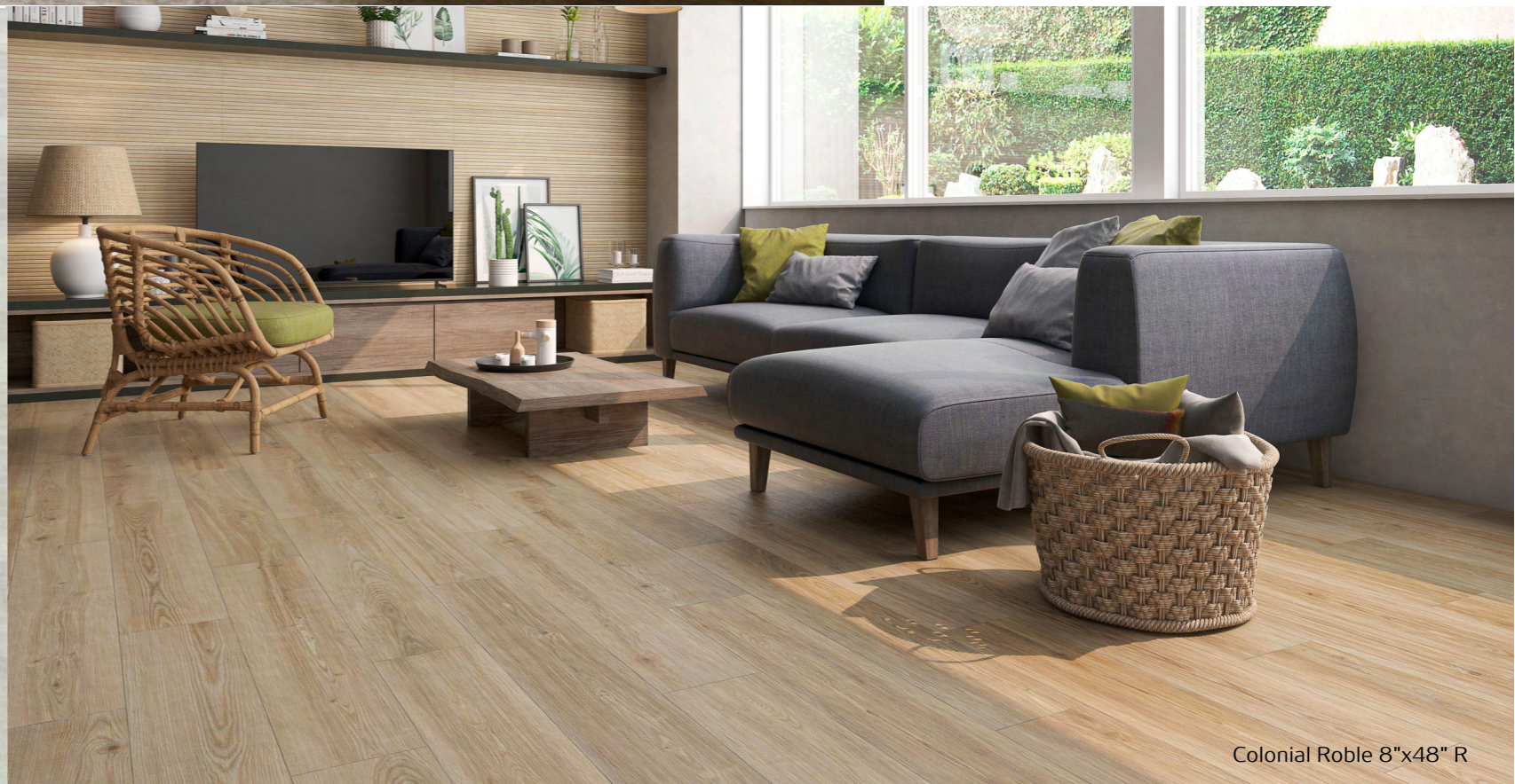
Colonial Roble 8"x48" R