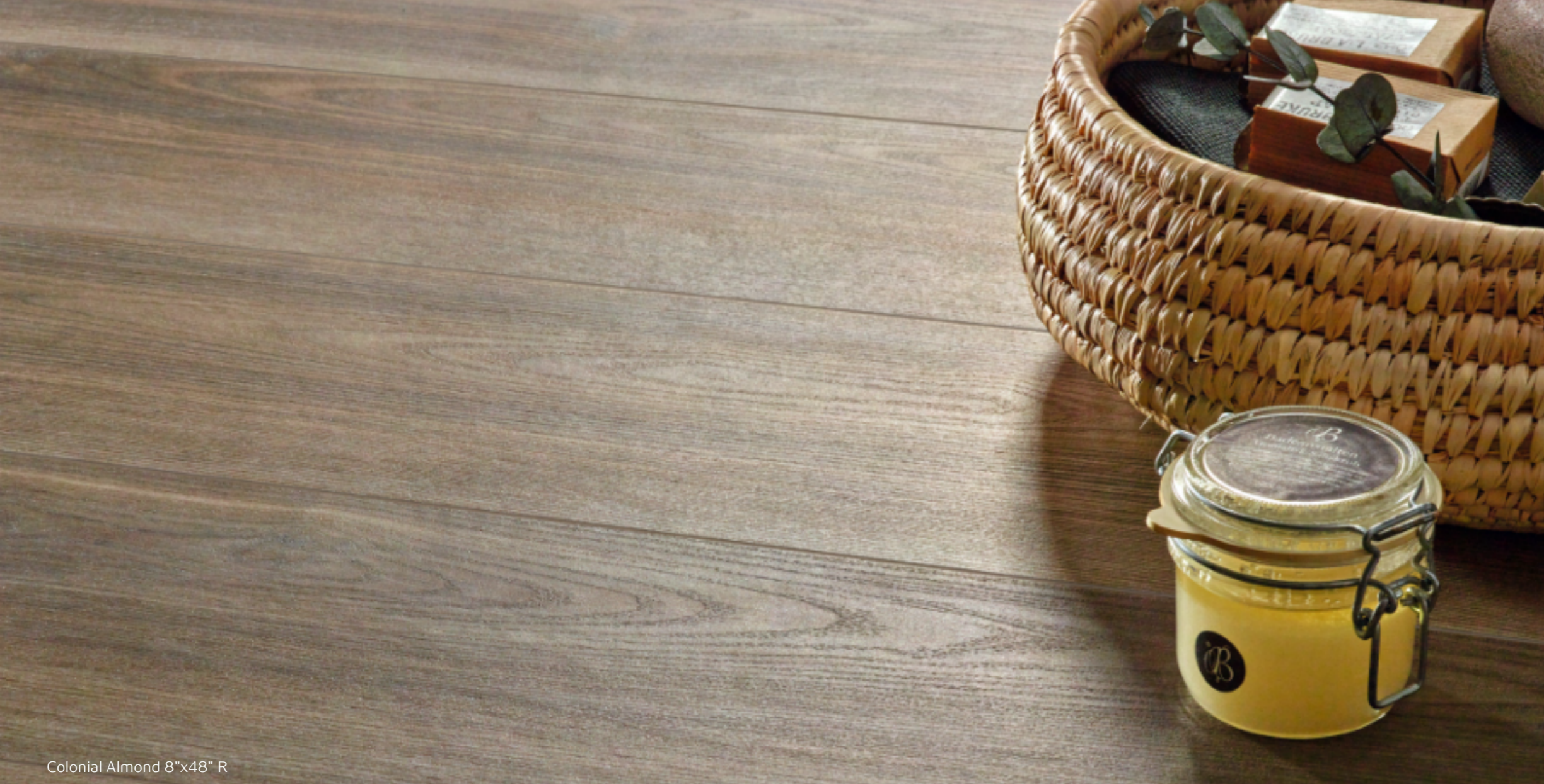
Colonial Almond 8"x48" R