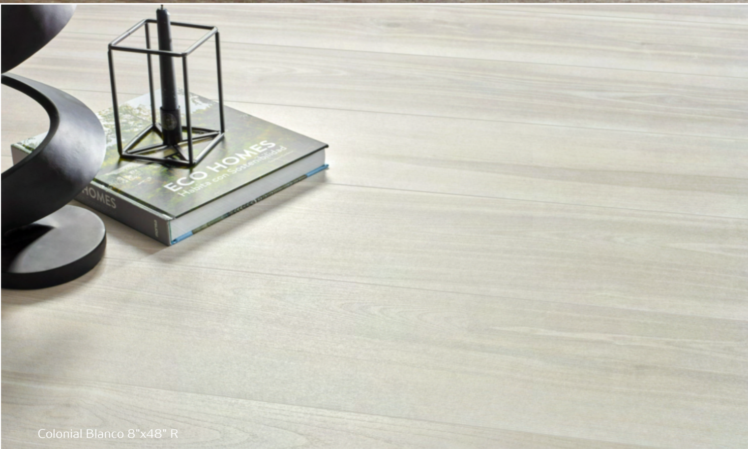
Colonial Blanco 8"x48" R