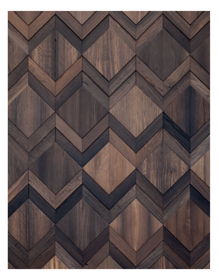
Bog Oak • Central Europe • Luxury • High Quality