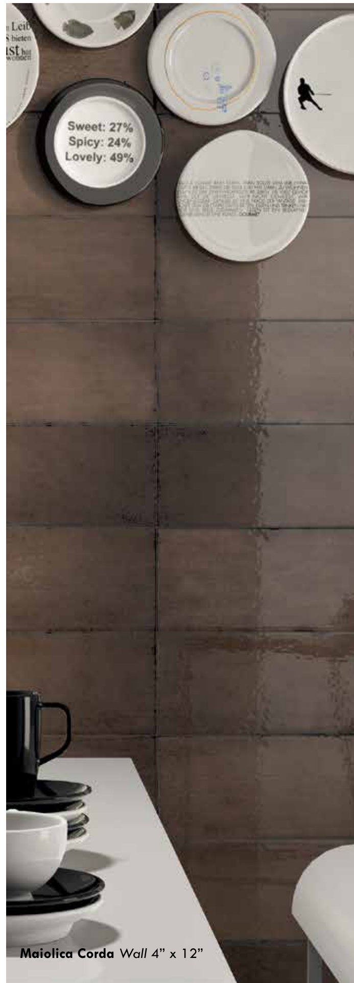
Maiolica Corda Wall 4" x 12"