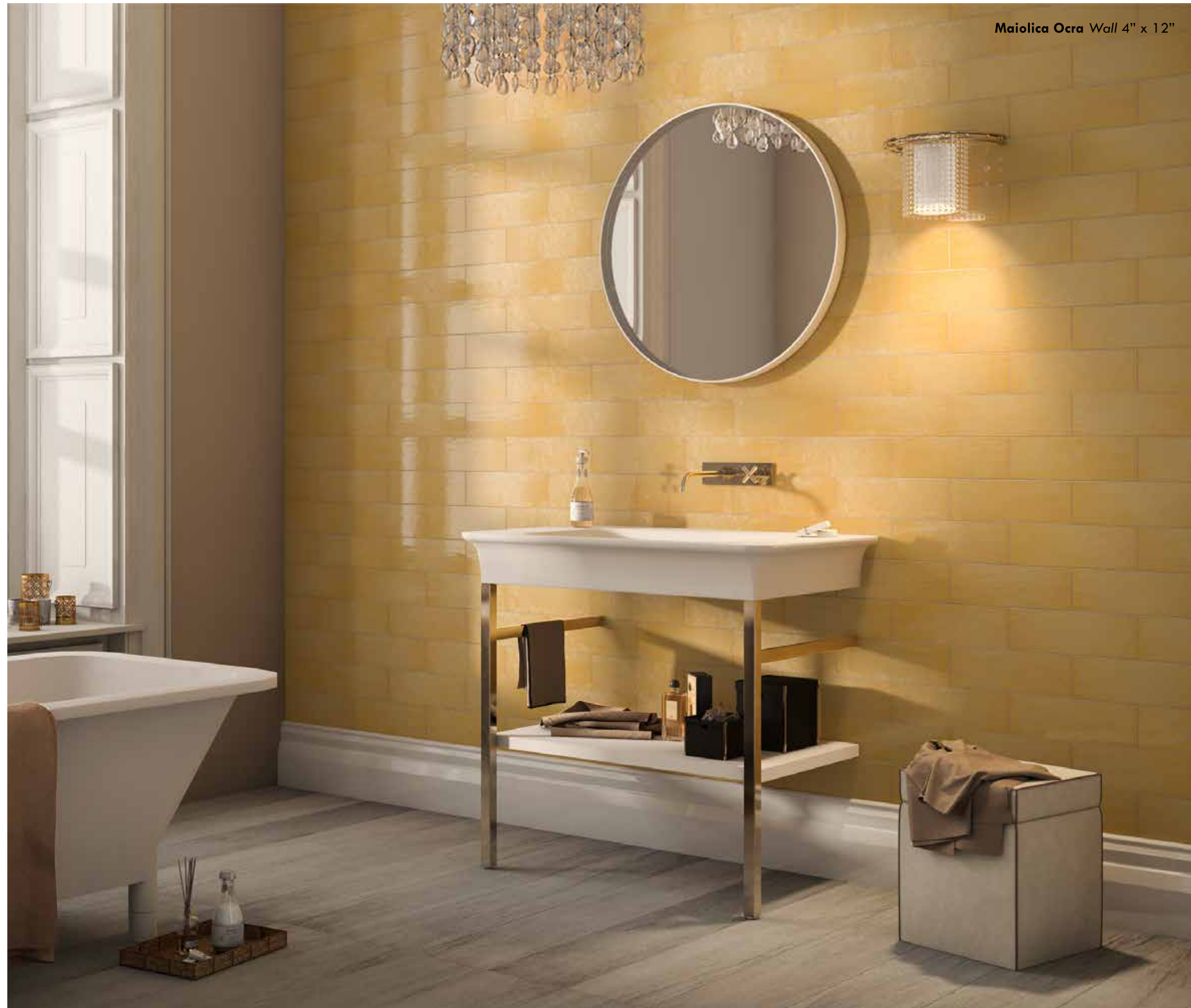
Maiolica Ocra Wall 4" x 12"