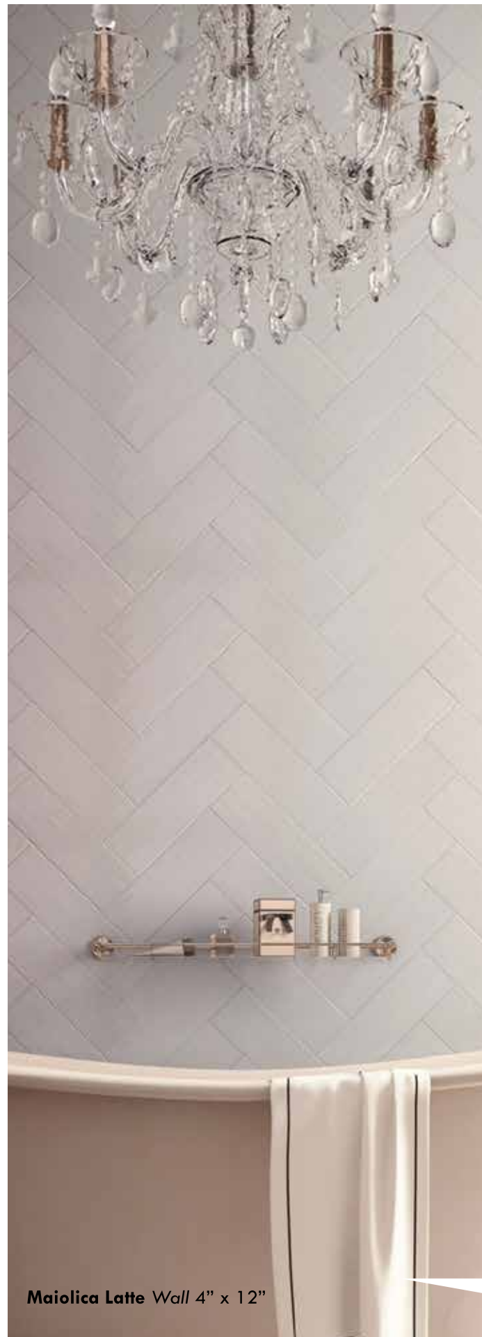
Maiolica Latte Wall 4" x 12"