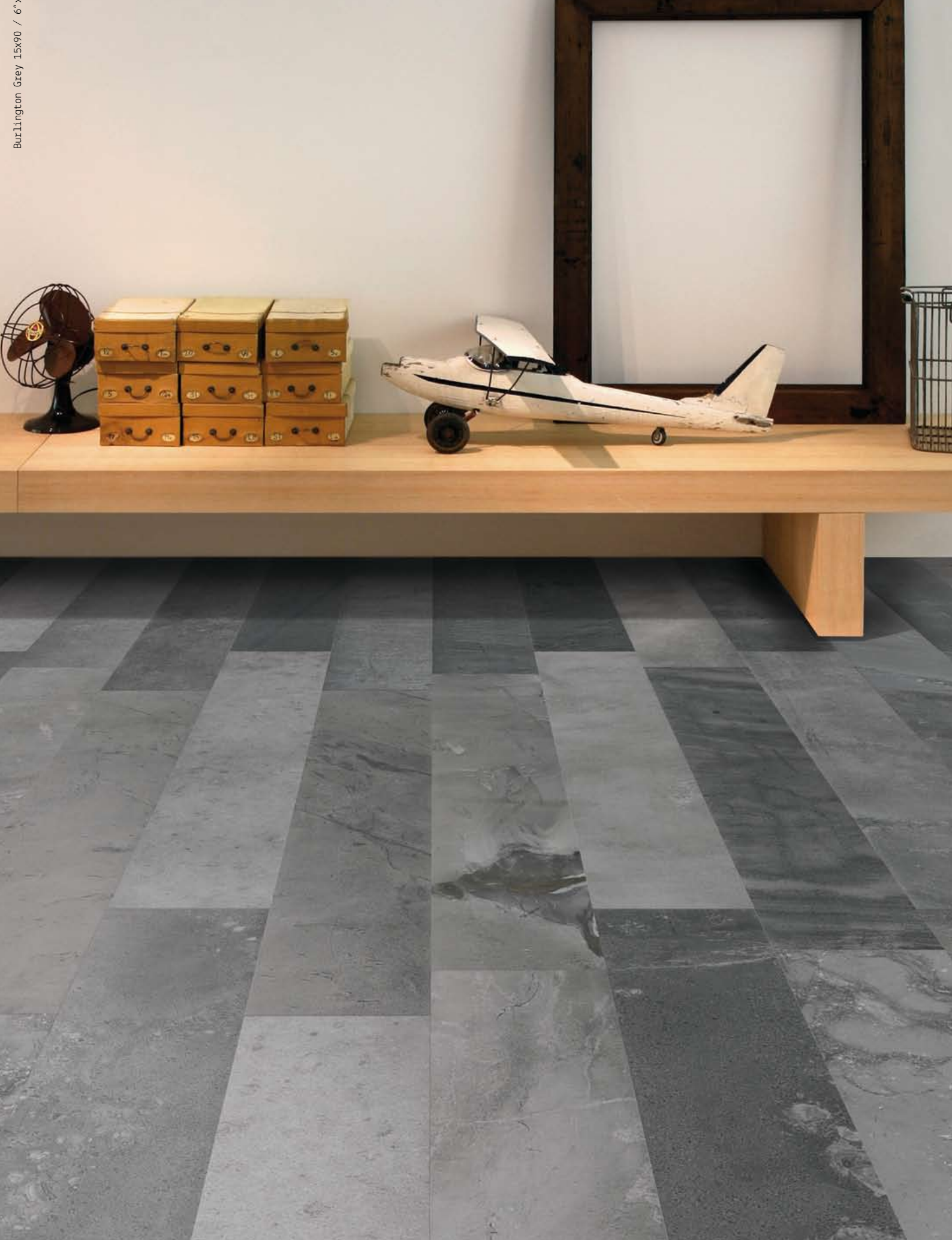
Burlington Grey 15x90 / 6"x36"