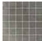
2x2 Mosaic on 12x12 Available in all colors