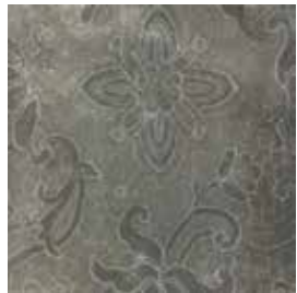
MTX Deco 24x24 Sold in sets of 4 random PCS 6 Patterns Available